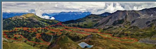
Secret Valley in Summer